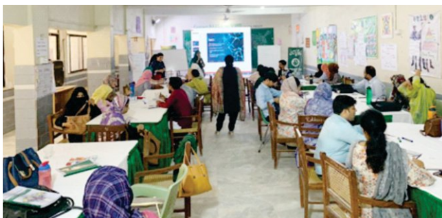
KARACHI: Training at GGSS BYJ Campus Near Central Jail.