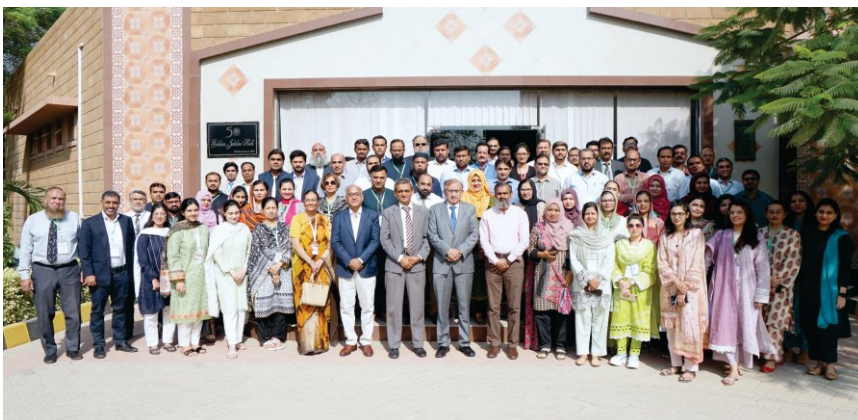
KARACHI: Group photo of participants present at the Collaborative Workshop for Times Higher Education the Impact Ranking of Public and Private Universities/DAIs in Sindh.

Date: 24 th October 2023 and 8 th November 2023