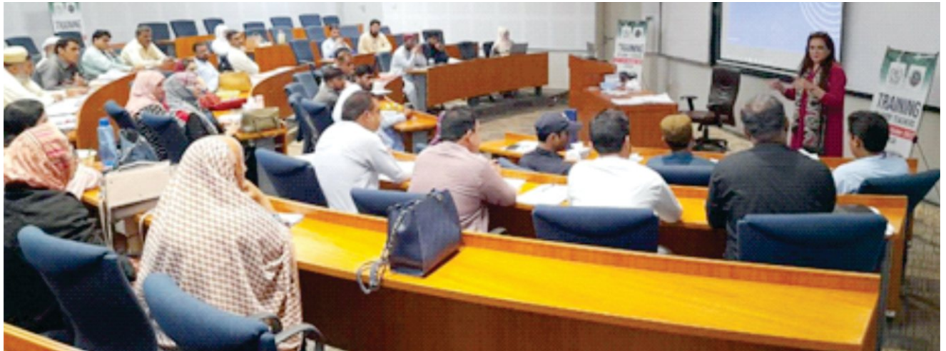
SUKKUR: Training of Guide Teachers held at Sukkur IBA University. Total 40 participants collectively attended training from District Sukkur & District Khairpur.