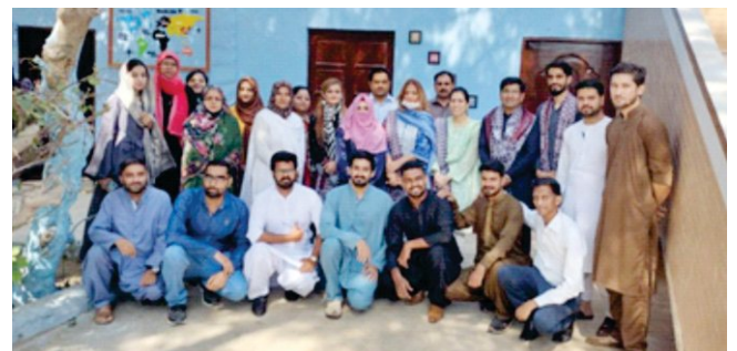
KARACHI: Training at GBSS PECHS No.2 Campus Karachi.