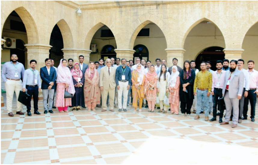
KARACHI: Group Photo of the participants of Research Training Programme conducted by Sindh HEC at Sindh Madressatul Islam University.

Date: 23 rd October 2023 and 30 th October 2023