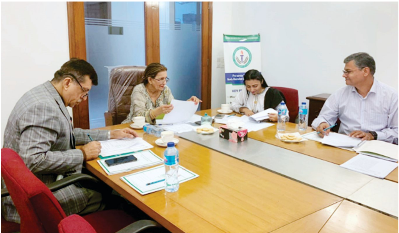
KARACHI: International Conference, Seminar and Symposium Committee Meeting in Process.

The second meeting of the Grant-in-Aid Committee for International Conference/Symposium was held in the conference room of Sindh HEC on November 13, 2023 to evaluate the