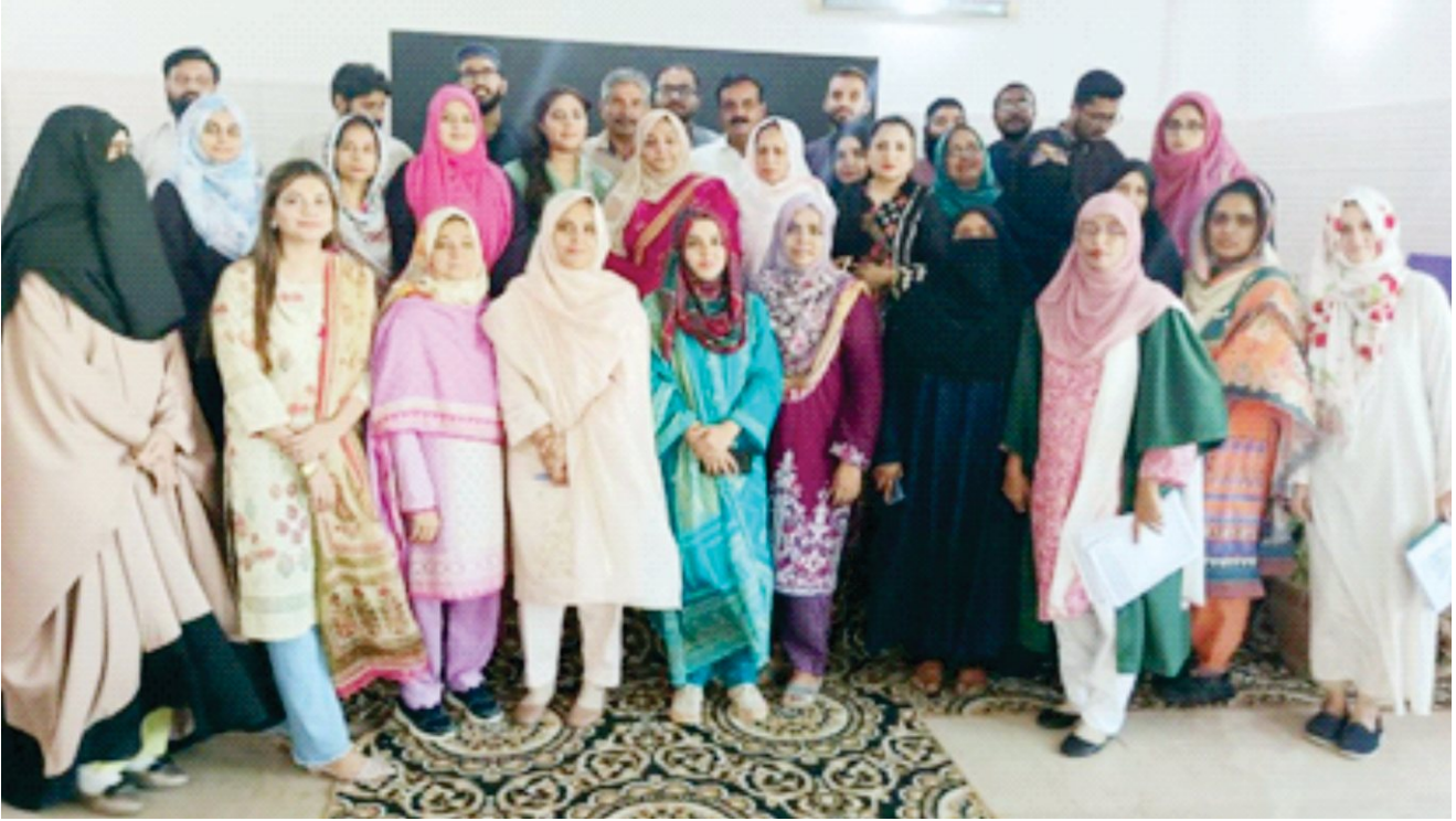
KARACHI: Training at GGHSS University Campus Karachi.