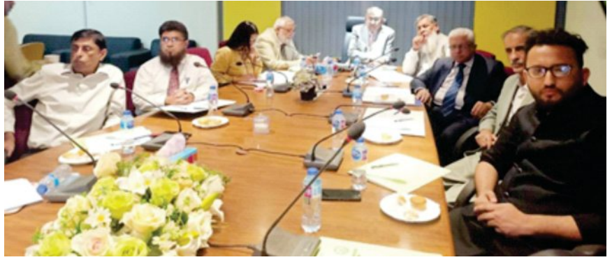
Karachi: Second Meeting for Collaboration of Russian and Pakistani Universities in process.

The second consultation meeting between Sindh Higher Education Commission and the Russian State atomic energy corporation 'Rosatom' was held on August 30.