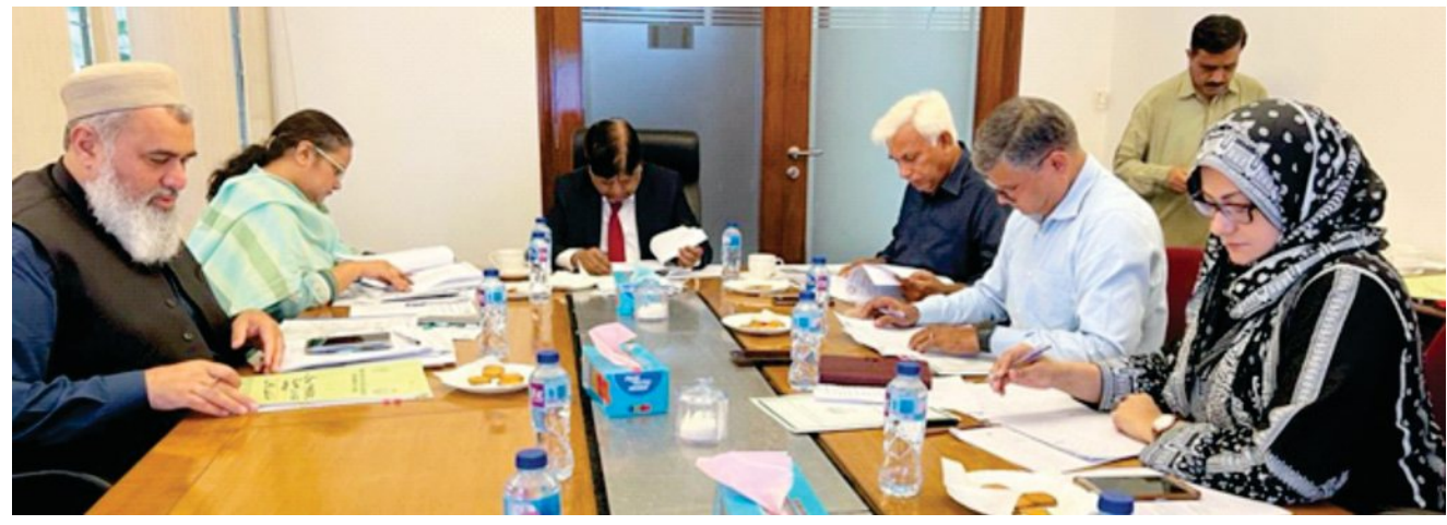
KARACHI: Sindh Lab Strengthening Programme (SLSP) Committee Meeting in Process.

The Sindh HEC advertised in leading newspapers, dated 10<sup>th</sup> July 2023, for