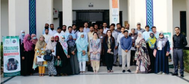
Training of Guide Teachers held on 27<sup>th</sup> & 28<sup>th</sup> September 2023 at Mehran University of Engineering & Technology, Jamshoro. Total 32 participants collectively attended training from District Jamshoro & District Tando Allahyar.