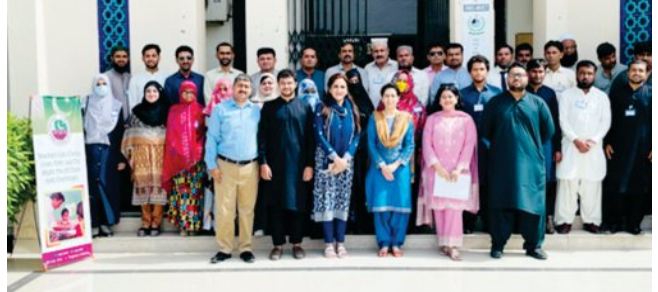
Training of Guide Teachers, held on 23<sup>rd</sup> & 24<sup>th</sup> August 2023 at Sukkur IBA University. Total 40 participants collectively attended training from District Sukkur & District Khairpur.