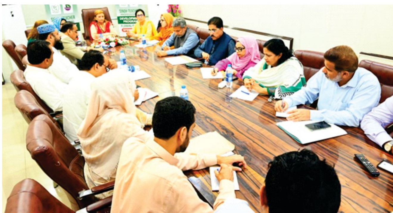
Meeting with Honorable Caretaker Minister for Education, Government of Sindh. It was held on 06<sup>th</sup> September, 2023 at Sindh Secretariat, Karachi and it was attended by Officers of Education Department of Government of Sindh, Director NCC, Officers of NCC, and officers from Sindh HEC.