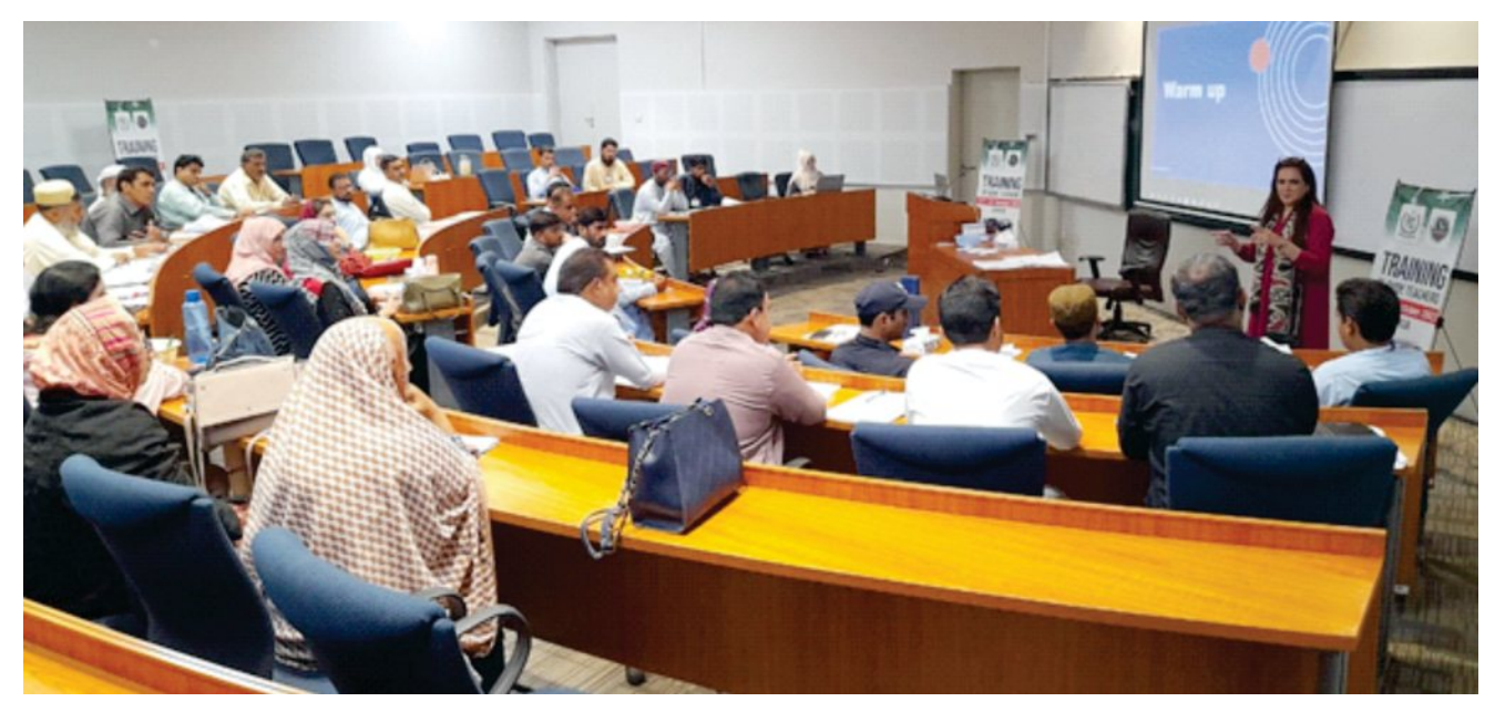
Training of Guide Teachers, held on 11<sup>th</sup>, 12<sup>th</sup> & 13<sup>th</sup> October 2023 at Sukkur IBA University. Total 40 participants collectively attended training from District Sukkur & District Khairpur.